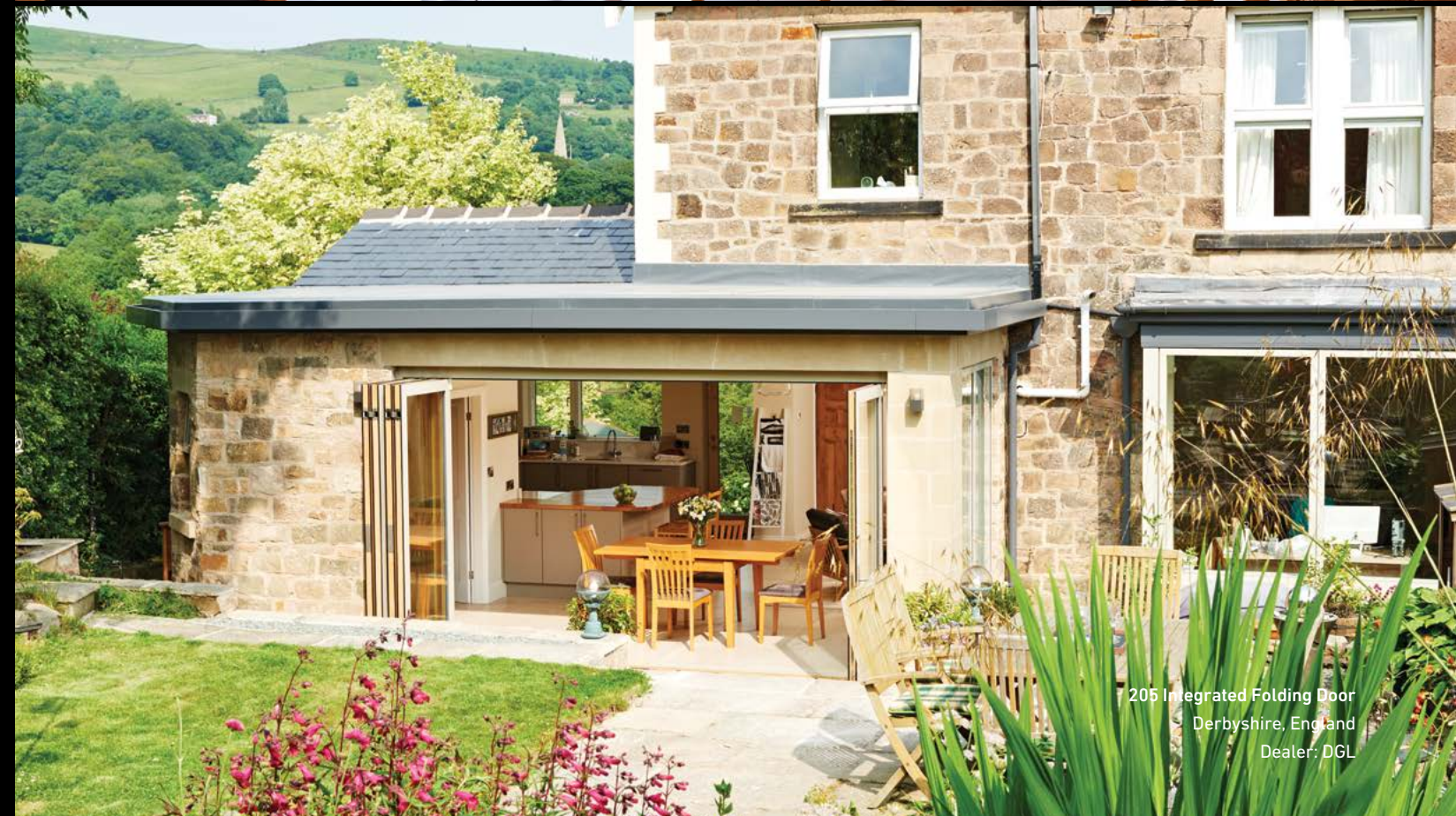
205 Integrated Folding Door Derbyshire, England Dealer: DGL