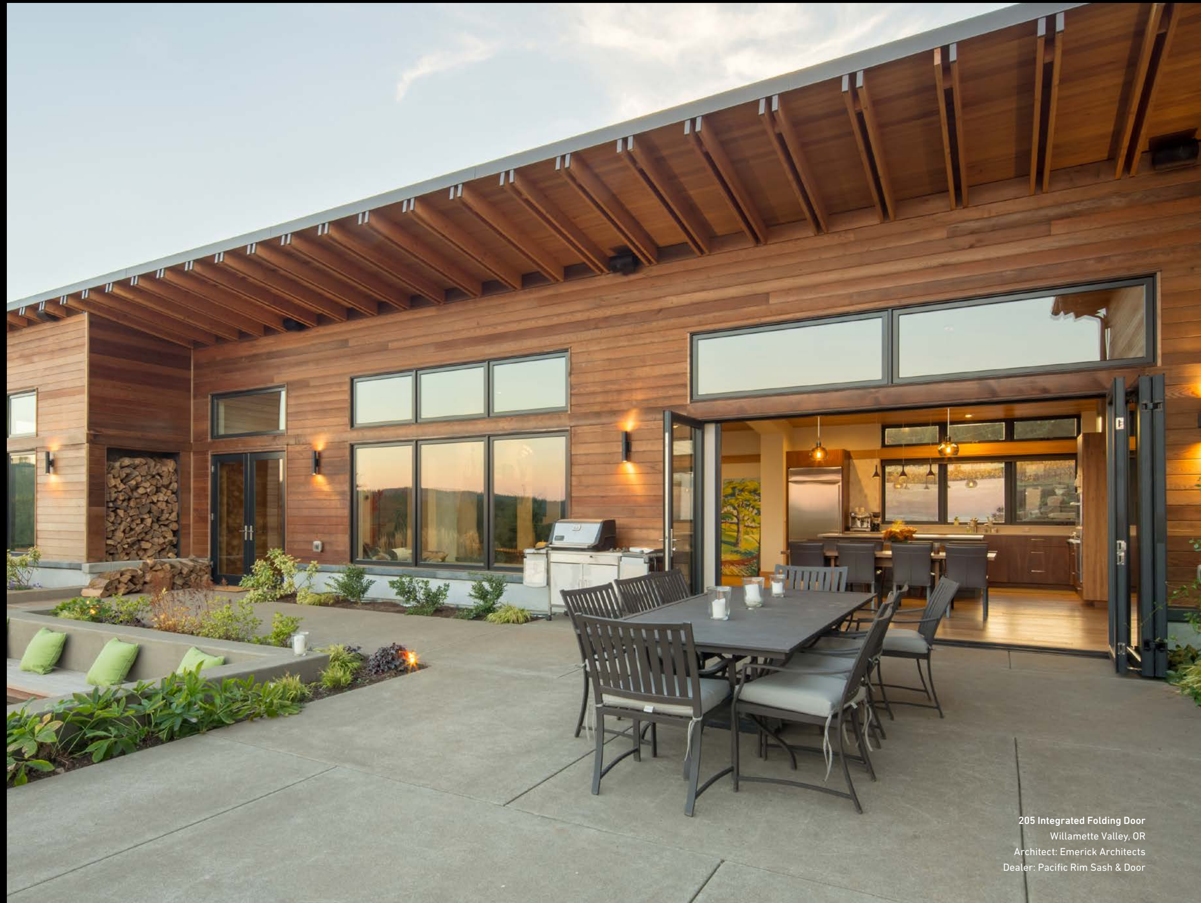
205 Integrated Folding Door Willamette Valley, OR Architect: Emerick Architects Dealer: Pacific Rim Sash & Door

Create the perfect opening to suit your lifestyle with our selection of door types. Choose from Sliding, Folding, Cornerless Folding, French and Single Doors, including Folding and Sliding and Fixed-lite Windows.