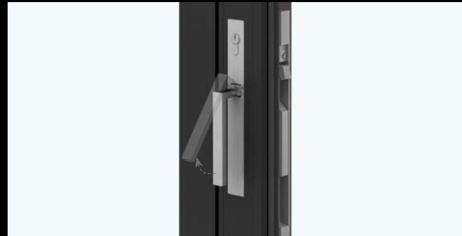
Access Autolatch™ exterior pull-handle