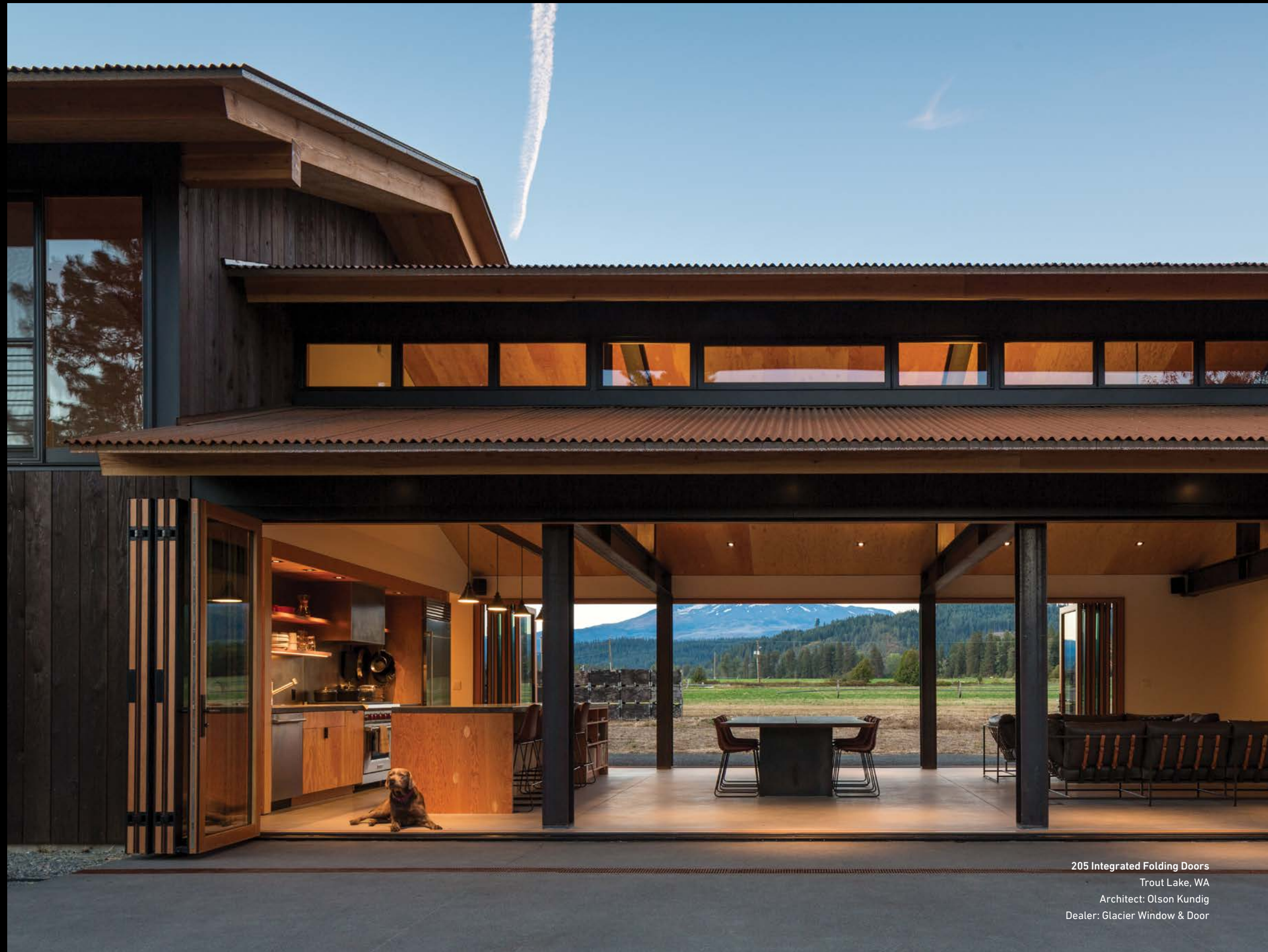
205 Integrated Folding Doors Trout Lake, WA Architect: Olson Kundig Dealer: Glacier Window & Door

At Centor®, we believe you should have the beauty of the outdoors in your home and the control you need for maximum comfort and enjoyment. We want you to be able to create true inside-outside living, without the compromises.