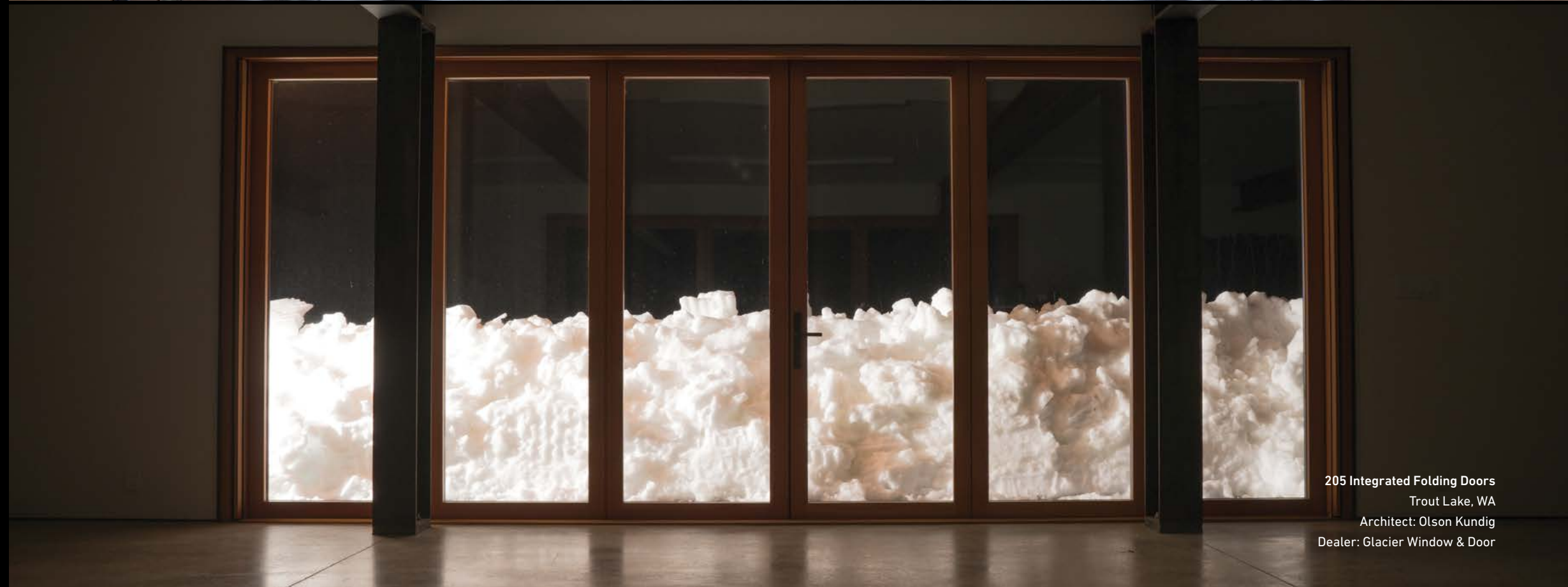
205 Integrated Folding Doors Trout Lake, WA Architect: Olson Kundig Dealer: Glacier Window & Door