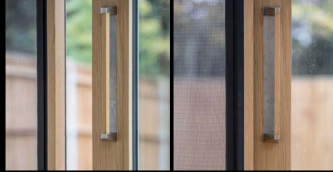
Interior sliding handle

The interior handle of our sliding doors features a wood trim that's matched to the finish of the door frame, with the handle acting as a stop for the insect screen, ensuring that it only covers the open area of the door.