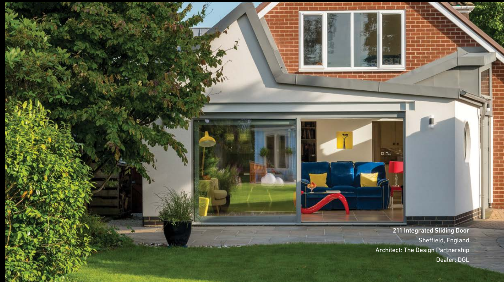
211 Integrated Sliding Door Sheffield, England Architect: The Design Partnership Dealer: DGL