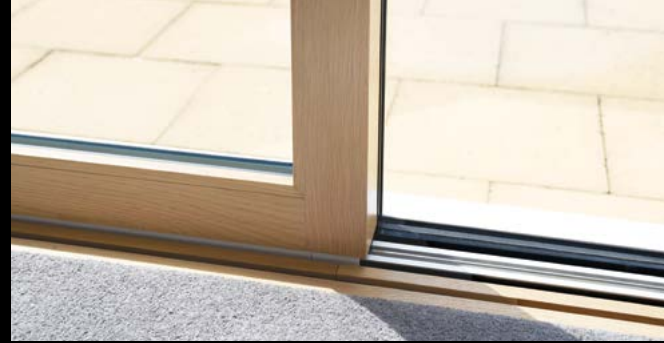
Sliding panel aligns with the mullion

Centor Integrated Sliding Door panels can be specified as symmetrical for a greater flow between inside and out, or asymmetrical for a greater area of uninterrupted glass.