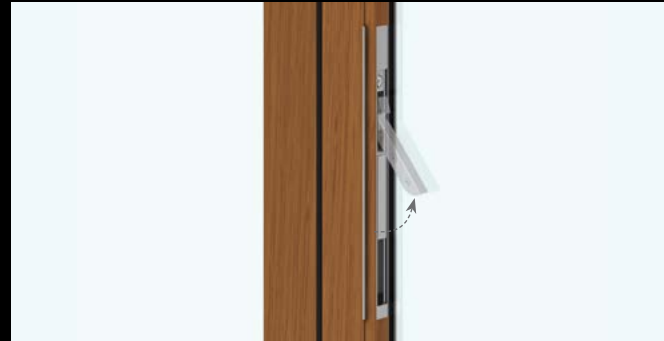
Access Autolatch™ interior lever and signifier

To see the full range of specifications for Folding Doors, visit centor.com .